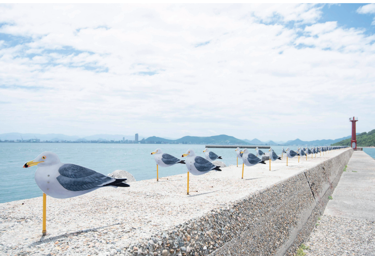
Takahito Kimura "Sea Gulls Parking Lot"